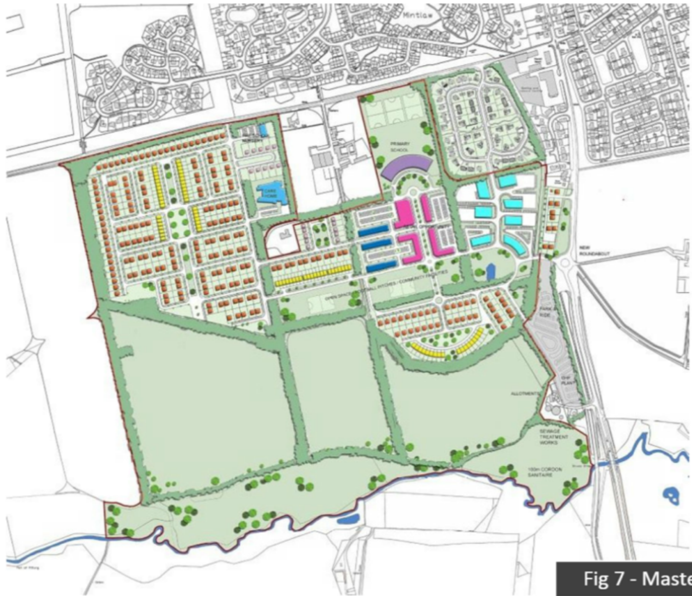
Fig 7 - Masterplan