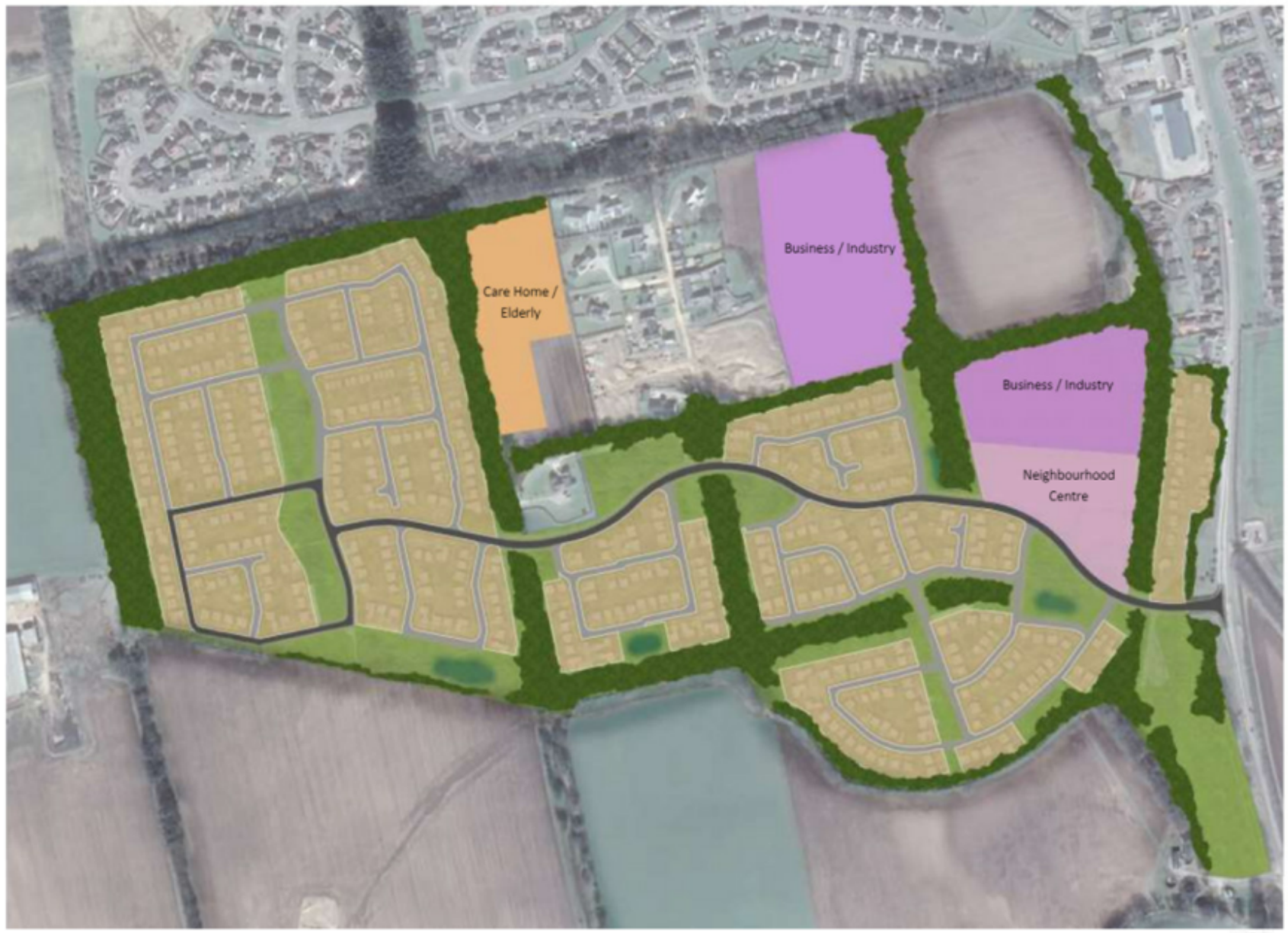
Proposed masterplan diagram.